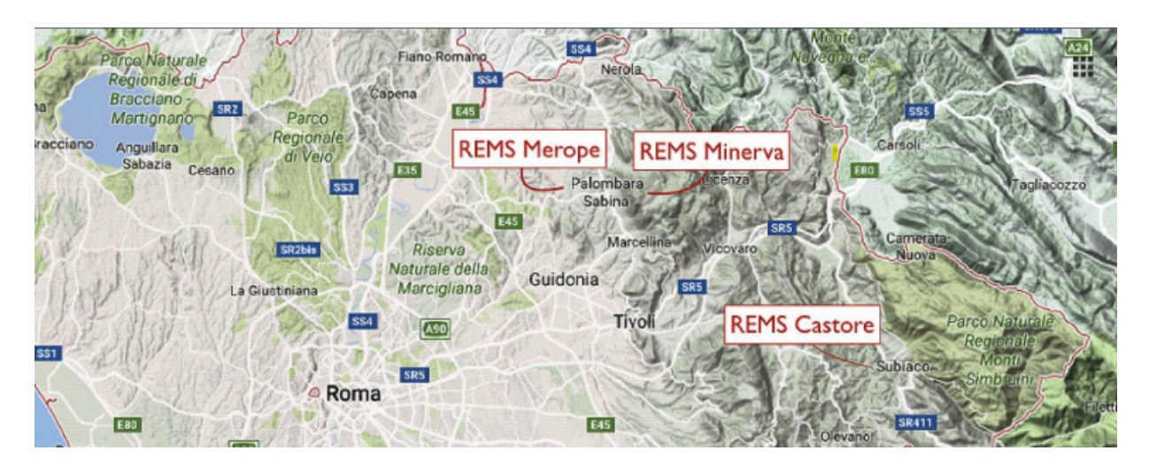
REMS offices in the territory of ASL RM 5

There were preliminary contacts between the heads of the ASL and the CPIA, in which the Guarantor of persons subject to measures restricting personal freedom in Lazio also participated. A number of operational meetings followed, during which the organisation of teaching activities was finalised and the time and methods for carrying out the experimentation were established.